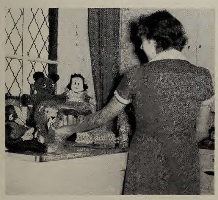
In most Reform Institutions inmates are encouraged to participate in any of the usual hobbies including Arts and Crafts.